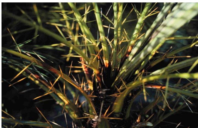
Figure 3. Note dark lesions caused by Pestalotiopsis on petioles of this Phoenix roebelenii , especially at base of young leaves emerging from bud.

It is not uncommon to observe or isolate more than one potential pathogen from the same diseased tissue. In some cases, it is apparent which fungus was the first pathogen to invade the healthy tissue, while the second fungus moved into the resulting necrotic (dead) tissue as a saprobe.