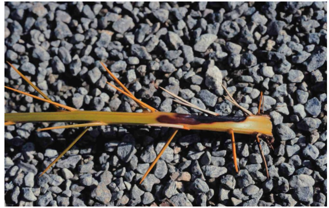
Figure 2. Petiole lesion on Phoenix roebelenii due to Pestalotiopsis .

If the pathogen is restricted to only causing leaf spots, the disease may not be very damaging to the palm, especially a mature palm in the landscape. However, with juvenile palms that have no trunk and only a few leaves, the palm could be severely affected by the leaf spots.